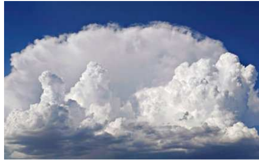
Figure 1. A common Cumulonimbus Capillatus Incus cloud rendered using our system. This is the most common kind of cloud seen in other cloud rendering systems. This type of cloud renders at 30fps in our system.

Future work may include adding arbitrary shapes to the clouds and deformation functions to simulate the changing of the shape between types of clouds. Also, more care